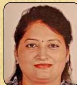
Vaishnavi Kathaley Self Help Group, Women Thrust Area